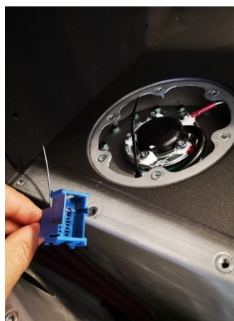
Tank level sensor plug