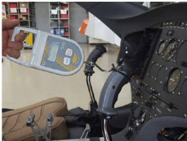
Fig 3 Force gauge to measure stick load