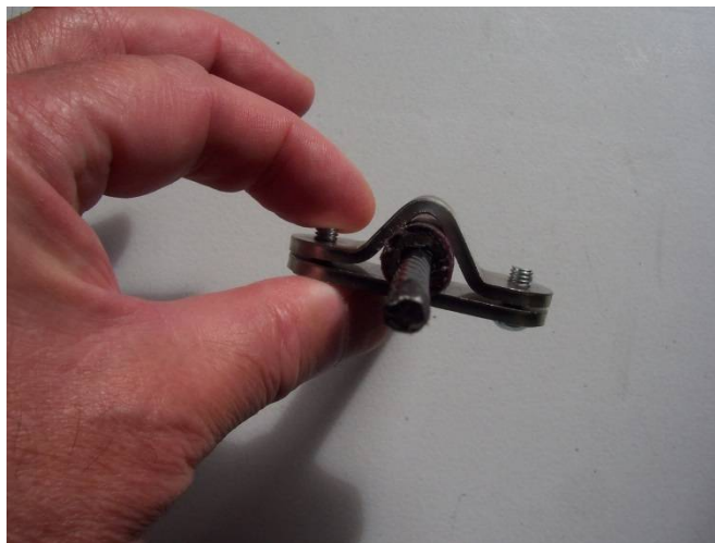
Fig 2 Control cable clamp